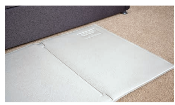
The SSD-PM2 features an extra large surface area meaning more of the floor is covered