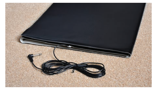
When not in use, the SSD-PM2 can be safely folded to just a third of its original size, perfect for storing